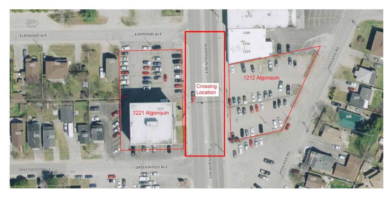
Figure 2 - Pedestrian Desired Crossing Location near the Medical Building

Data showed that most pedestrians crossing Algonquin at this location were travelling to/from a parking lot at 1212 Algonquin to the Medical Building. The parking lot at 1212 Algonquin is owned by a tenant of the Medical Building for purpose of additional parking. The crossing location and both properties described are illustrated in Figure 2 – Pedestrian Desired Crossing Location near the Medical Building.