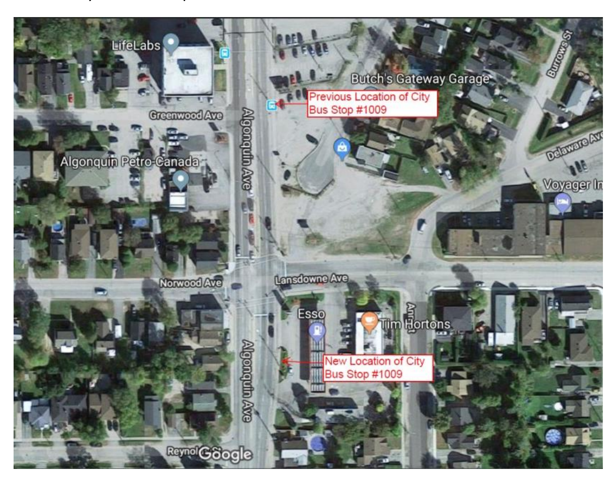
Figure 3 - Relocated City Transit Stop #1009

With efforts to reduce the number of pedestrians crossing Algonquin near the Medical Building, the northbound City bus stop was relocated on December 4 2017. The bus stop was previously located directly across from the Medical Building. The new location of the bus stop is in front of the Gas Station/Tim Hortons commercial property. By relocating this bus stop, transit users heading to the Medical Building are encouraged to cross at the signalized intersection at Lansdowne/Norwood Avenue as it is the most direct route. An illustration of the previous location of the bus stop and the relocation is found in Figure 3 – Relocated City Transit Stop #1009.