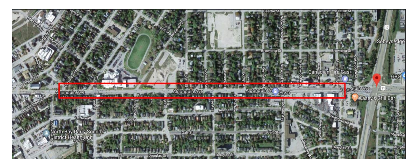
Figure 1 - Traffic Study Boundary