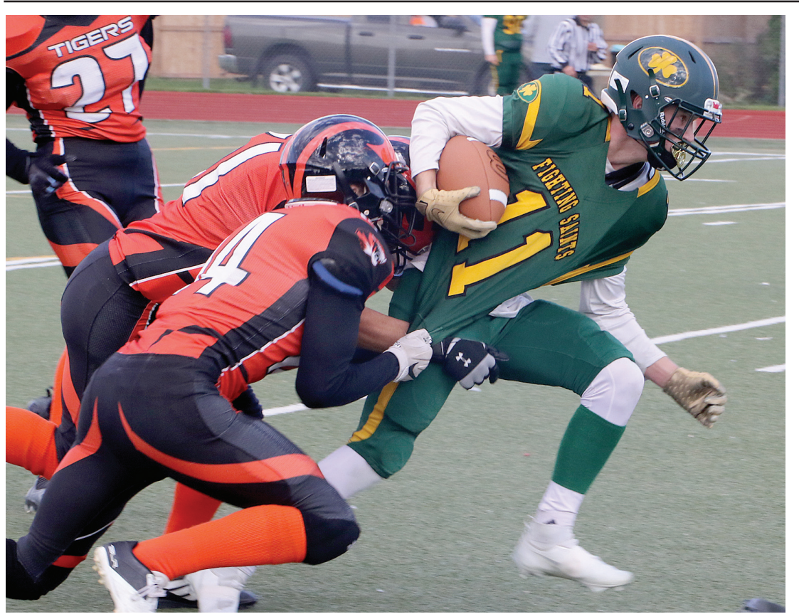
Improvements at Fort William Stadium were a top infrastructure priority in 2021, when the city ranked projects. (FILE)