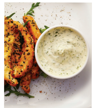
Tartar sauce is a staple with fish dishes.

You can buy them at Eat Local Pizza. If you're less inclined to see the parts of your sauce, or you just want to save time, you can grate