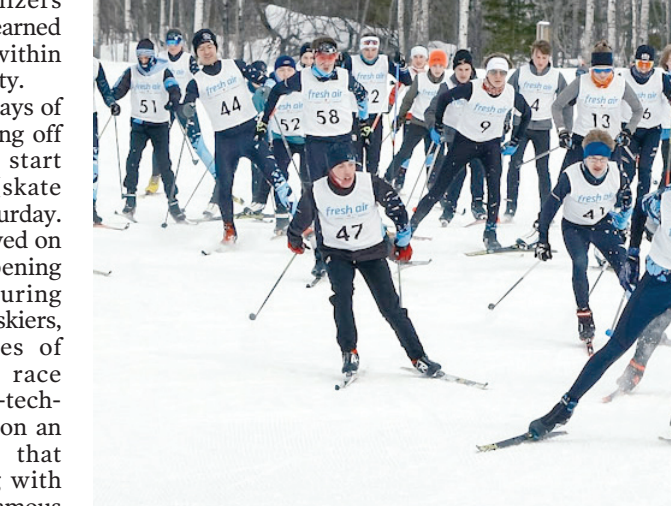
Lappe Nordic Ski Centre hosted last week's SSSAA championships. (Keith Hautala)

Other events in the lineup include classic technique team sprints and classic technique mass-start races ranging from 10 to 50 kilometres in