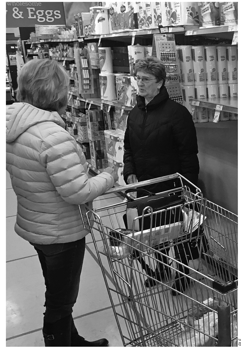
T-P SHORTAGE: Empty toilet paper shelves weren't uncommon this time last year.