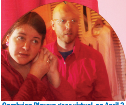
Cambrian Players goes virtual on April 3 with new offering, Love/Sick /11