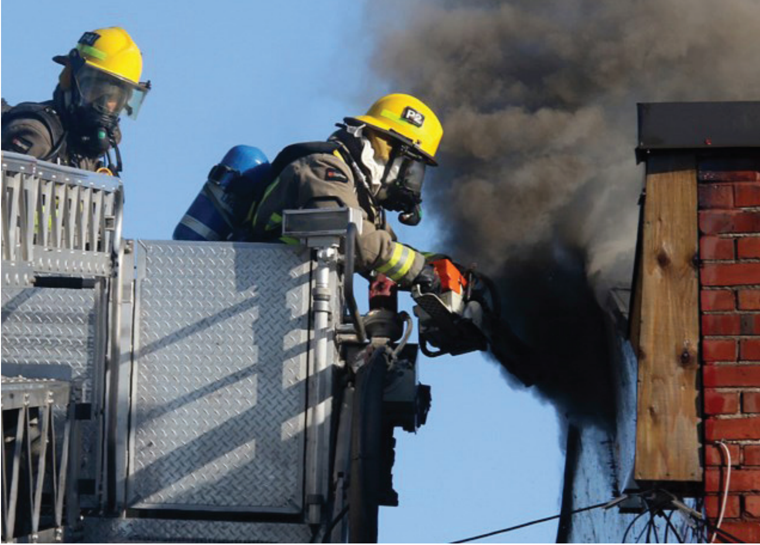
TOTAL LOSS: Thunder Bay Fire Rescue crews spent Friday night and parts of Saturday putting out a fire at the Star-Lite Flooring store in the Bay and Algoma area. No one was hurt.

Thunder Bay Fire Rescue, police investigating Bay Street fire as a possible arson /3