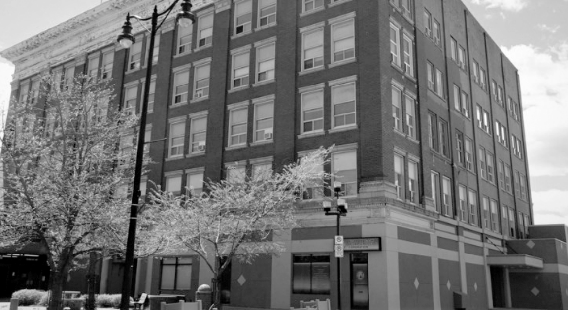
The Chapple Building is one of 16 that will be open to the public on Saturday as part of the Doors Open Thunder Bay program.

Another location on the tour is the N.M. Paterson building at 1918 Yonge St., now the headquarters of