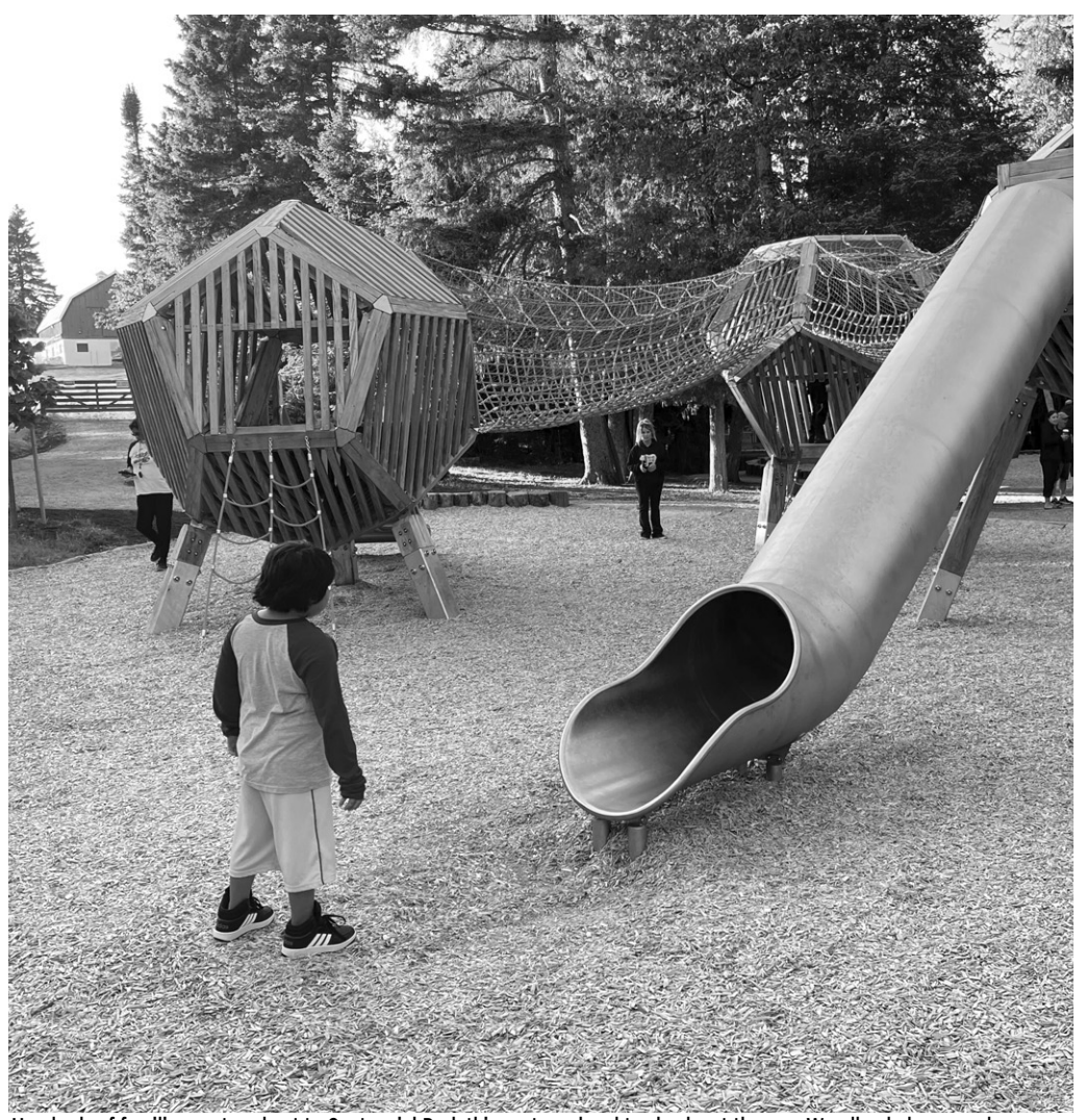
Hundreds of families ventured out to Centennial Park this past weekend to check out the new Woodland playground.