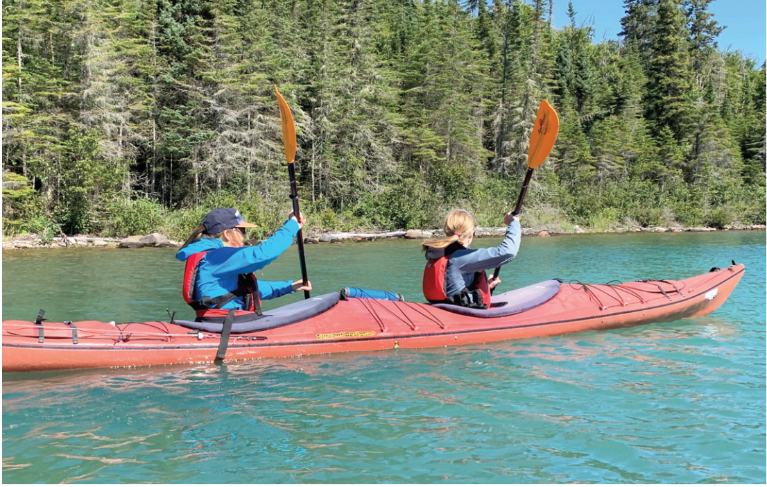
Canoeing near Rossport is a fun way to spend an afternoon. The community is small, but the area is known for its fishing too.

All proceeds support St. Joseph's Foundation 63 Carrie St. Thunder Bay, ON WWW.SJFTB.NET License #M835621