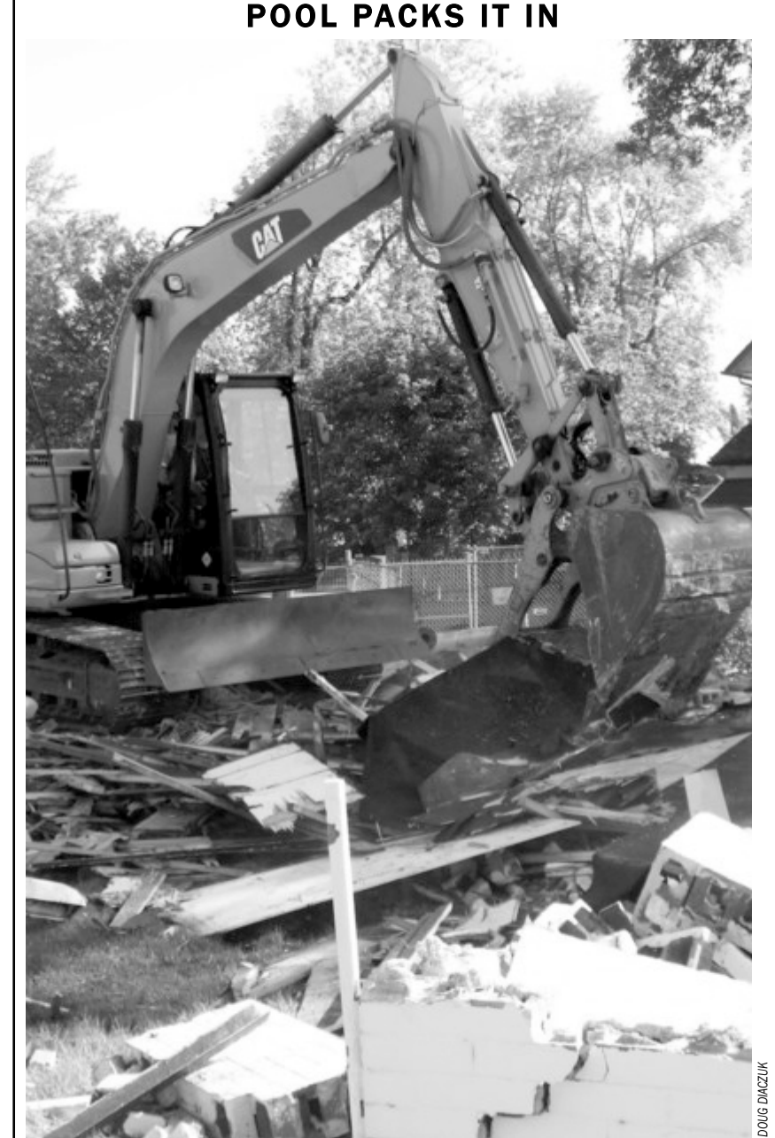
ERA ENDS: Demolition crews last Friday begin the teardown of the city's historic Dease Pool.