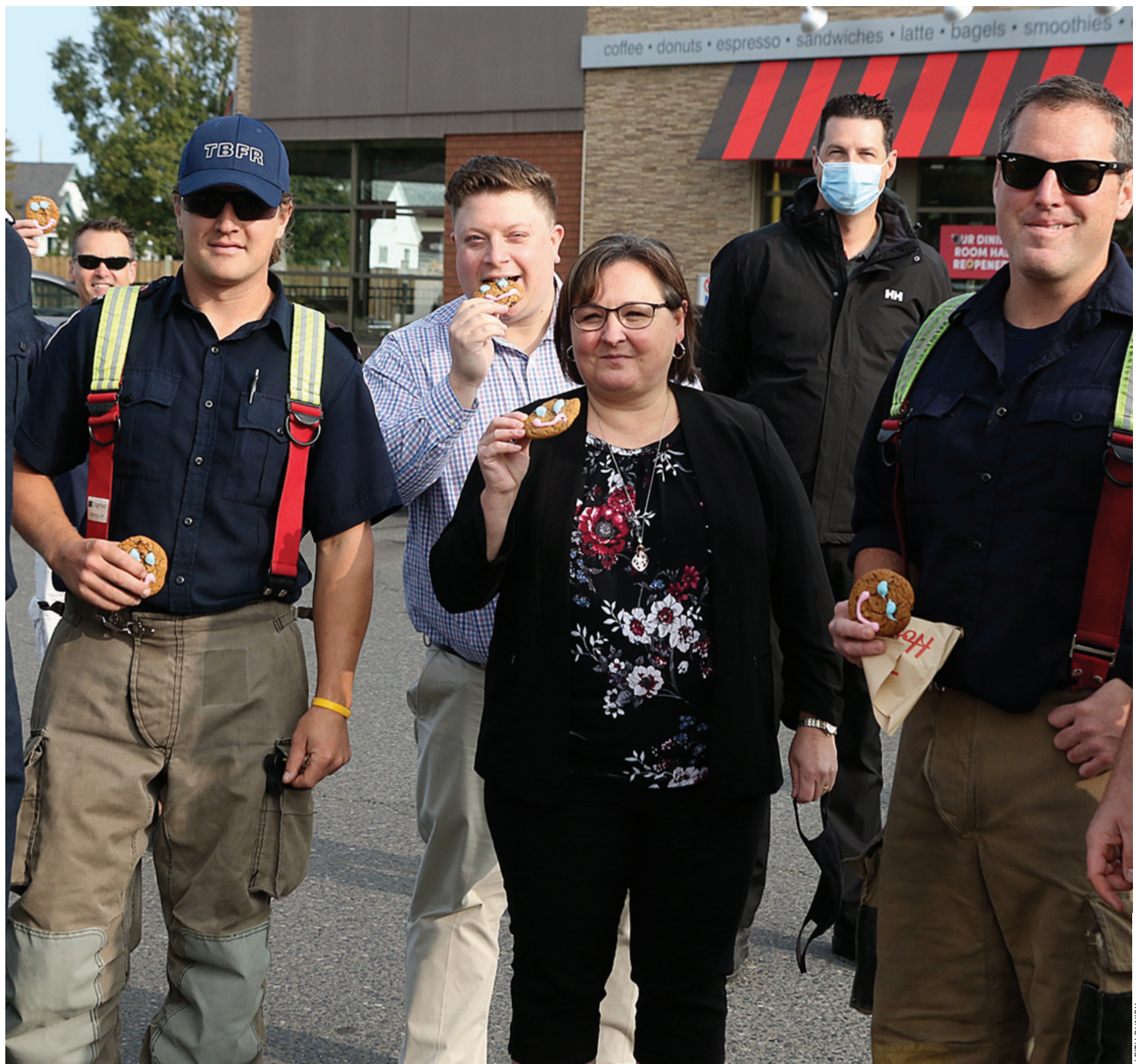
GENEROUS: Thunder Bay Professional Firefighters's Toys for Tots and the George Jeffrey Children's Centre are the beneficiaries of this year's Tim Hortons Smile Cookie campaign.

Tim Hortons launches annual Smile Cookie campaign in support of local charities /8