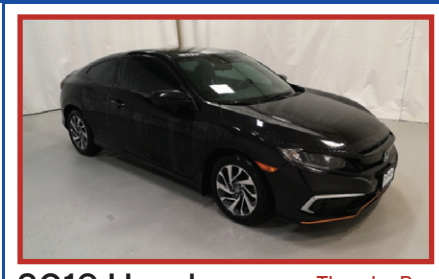
2019 Honda Civic Coupe LX