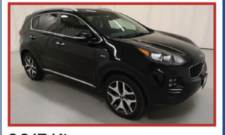
2017 Kia Sportage SX Turbo