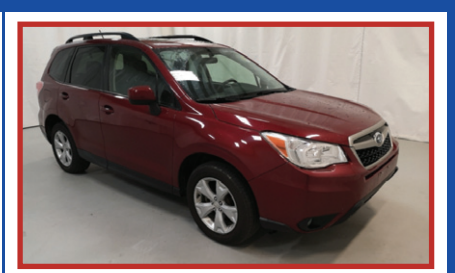
2014 Subaru Forester Ltd