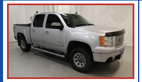
2013 GMC Thunder Bay Sierra 1500 SL Nevada