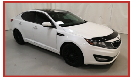
2013 Kia Optima EX Turbo