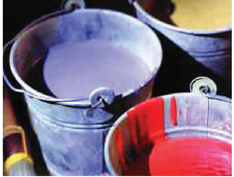
Colours are becoming richer and richer, thanks to innovative work by scientists around the world.

It was developed during a search for a highly reflective white coating to help