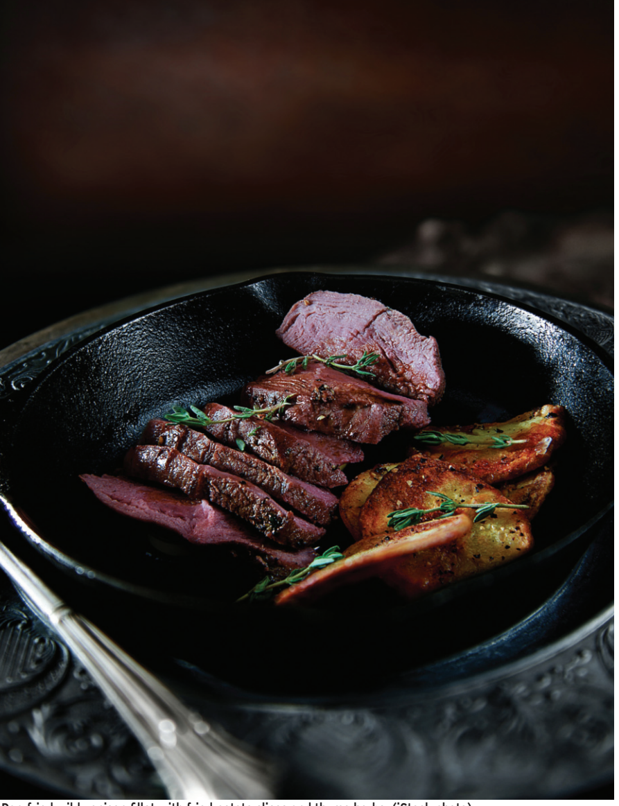
Pan-fried wild venison fillet with fried potato slices and thyme herbs.

Sherries and wines pair very well with venison, either as a drink pairing or as a part of the cooking process.