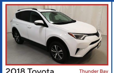
2018 Toyota Rav-4 LE