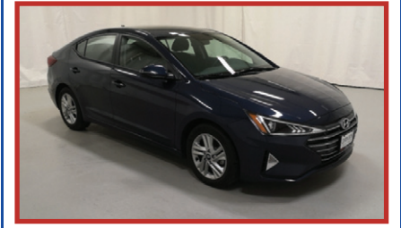
2020 Hyundai Elantra