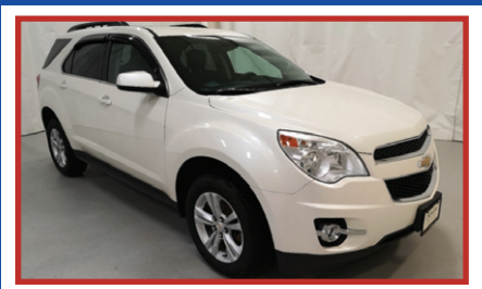
2015 Chevrolet Thunder Bay Equinox LT AWD