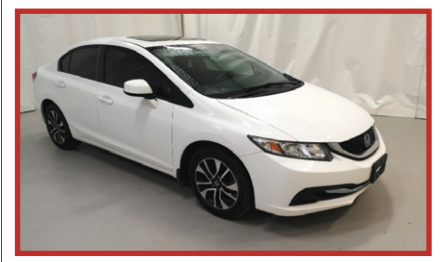
2013 Honda Civic EX