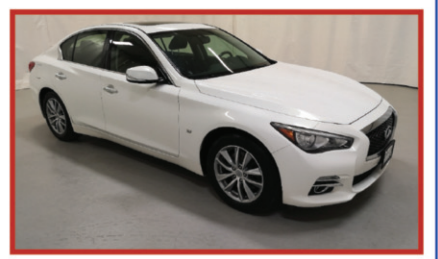
2014 INFINITI Thunder Bay Q50 Premium 64,798 KM | Stock #: 2647TA1 $22,990**