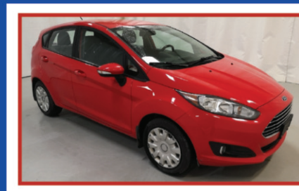
Thunder Bay 2015 Ford Fiesta SE Hatchback 104,052 KM | Stock #: 2752TA $9,000**