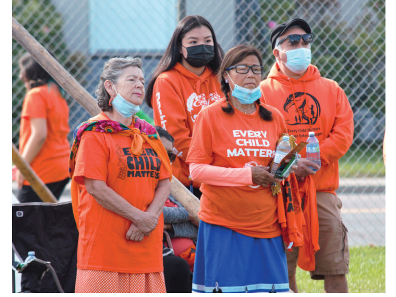
Several hundred showed up for NAN's Truth and Reconciliation event

grandmother bought her a new shirt for her first day, a shiny, orange shirt with a