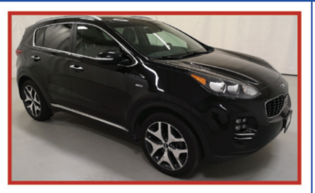
2017 Kia Thunder Bay Sportage SX Turbo AWD 119,408 KM | Stock #: 2737TA $24,500**