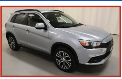
2017 Mitsubishi Thunder Bay RVR AWC 4dr 69,739 KM | Stock #: 2662TR1 $21,000 **