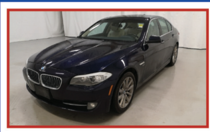
2012 BMW Thunder Bay 5 Series 528i xDrive AWD 126,605 KM | Stock #:2751TA $16,990**