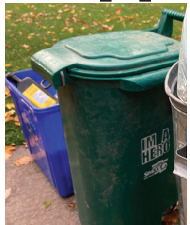
New recycling rules are coming. (FILE)

It's uncertain how much revenue there will be to divide, however. The recycling industry has struggled in recent years, Sherband said, with previous reports to council indicating there would likely be no market demand for #3 to #7 plastics.