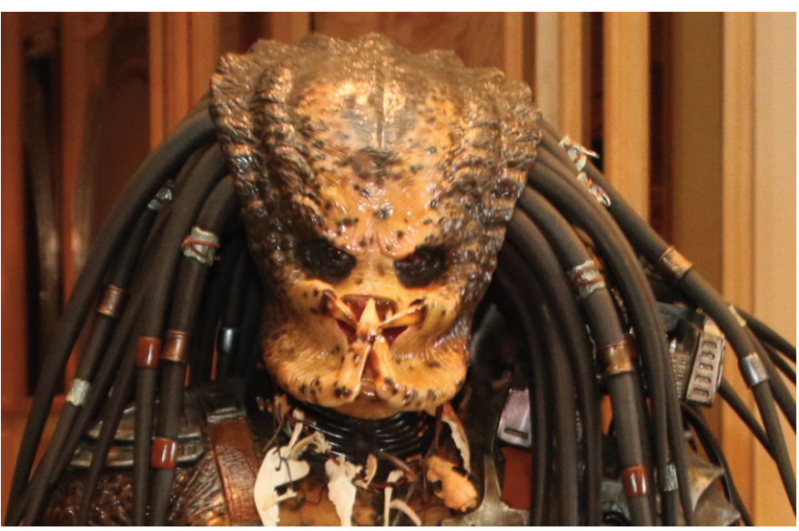
ThunderCon has been put on hold for the past two years becaue of COVID-19, but returns in 2022. (FILE)

The economic effects of the pandemic have been felt especially hard in the entertainment and retail sectors, so ThunderCon