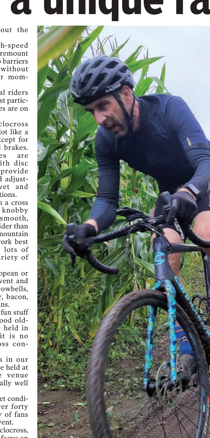
The sport of cyclocross has started to catch on in Thunder Bay.

In Thunder Bay, the annual autumn cyclocross race series has truly become one of the most enjoyable things to look forward to each autumn.