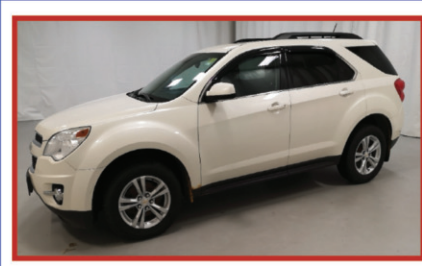
2015 Chevrolet Thunder Bay Equinox LTAWD 142,544 KM | Stock #: 2691TW $14,000**