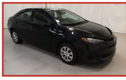
2017 Toyota Thunder Bay Corolla CE 111,090 KM | Stock #: 2753TA $15,900**