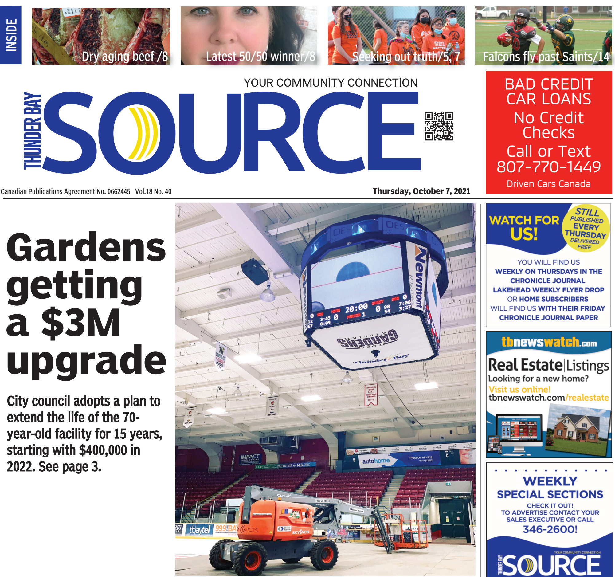
Fort William Gardens, which will host the Scotties in 2022, has gotten a new score clock.