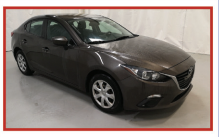
2016 Mazda Thunder Bay Mazda3GX 109,706 KM | Stock #: 2752TA $12,990**