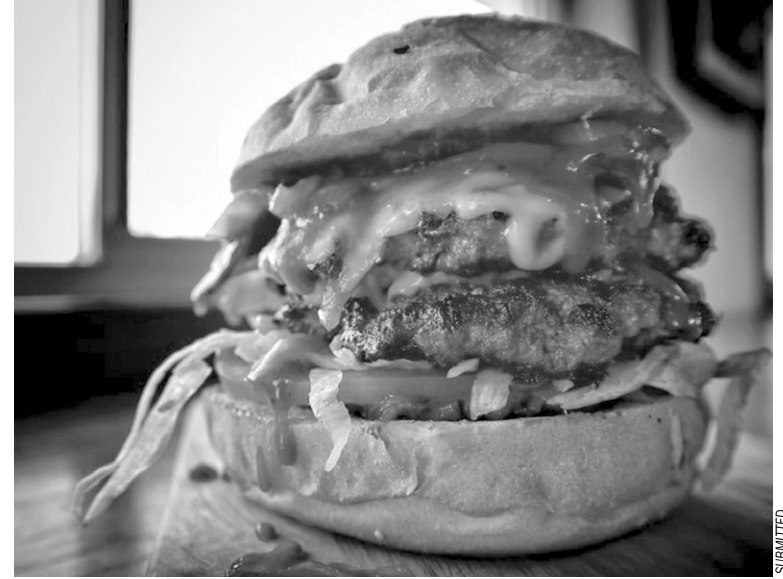
TASTY: Beefcake's Burger Factory created this specialty burger for the United Way.

They sold a total of 637 over the course of last month, resulting in $1,274