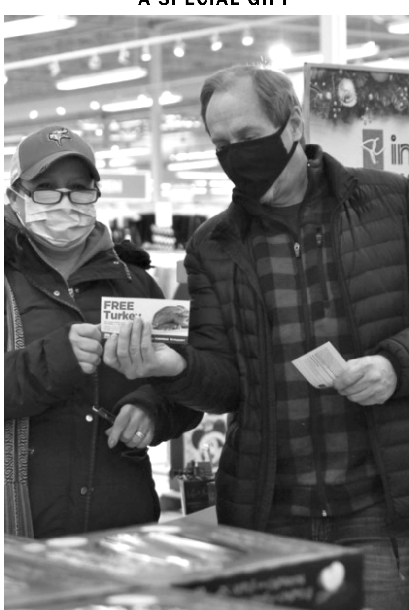
IN THE SPIRIT OF THE SEASON SEIU Healthcare gave out turkeys to nearly 300 local healthcare workers over the weekend