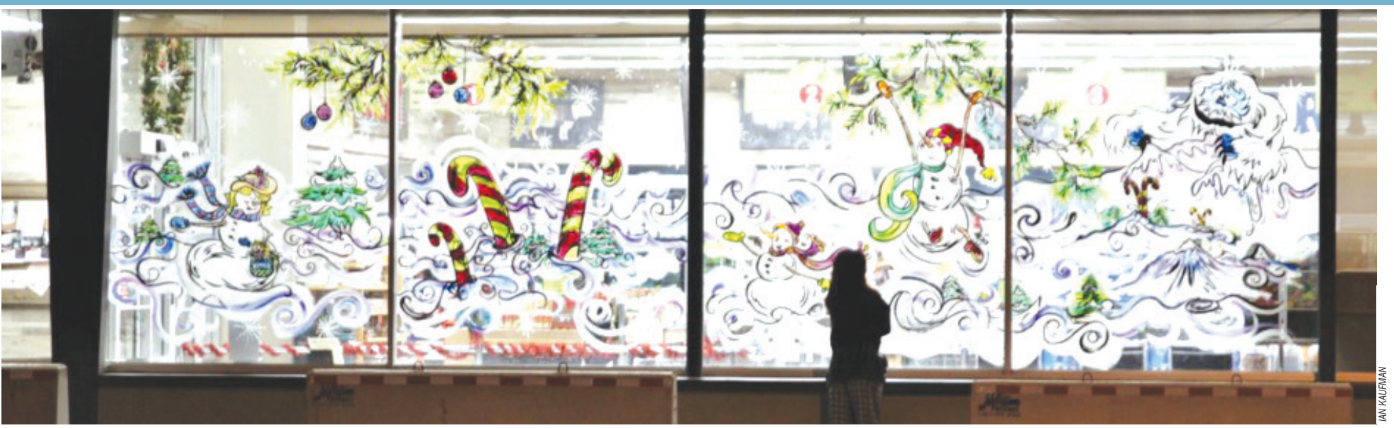
UNIQUE DECORATIONS: Residents inspect a holiday window painting in Westfort Saturday evening.